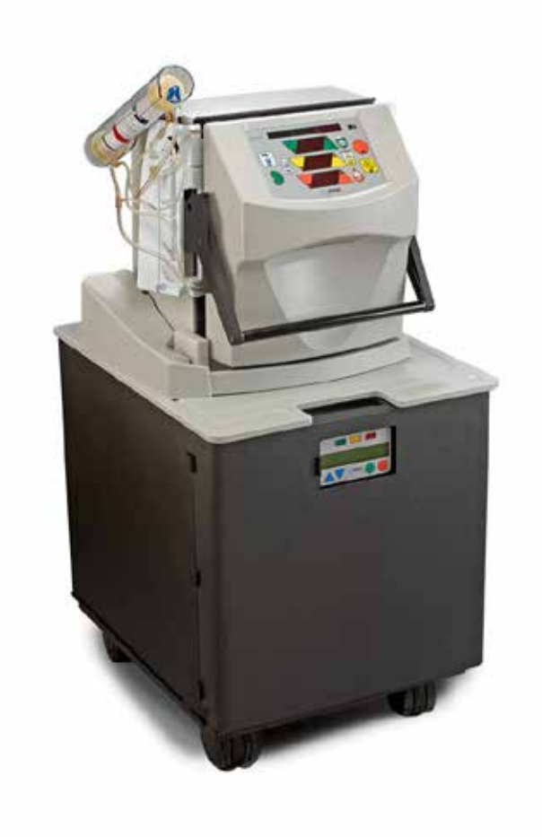
{\sf PureFlow}^{\sf TM}\,{\sf SL}\,\,{\sf Dialysate}\,\,{\sf Preparation}\,\,{\sf System}